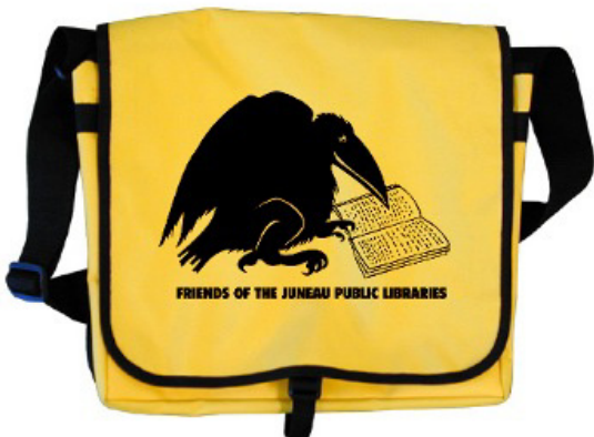
"Safety Yellow" Messenger Bag $25

Posters, cards and bags are available im- printed with the 20th Anniversary com- memorative graphic.