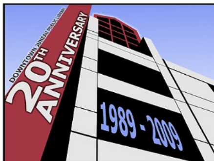
Canvas Tote $16

Posters, cards and bags are available im- printed with the 20th Anniversary com- memorative graphic.